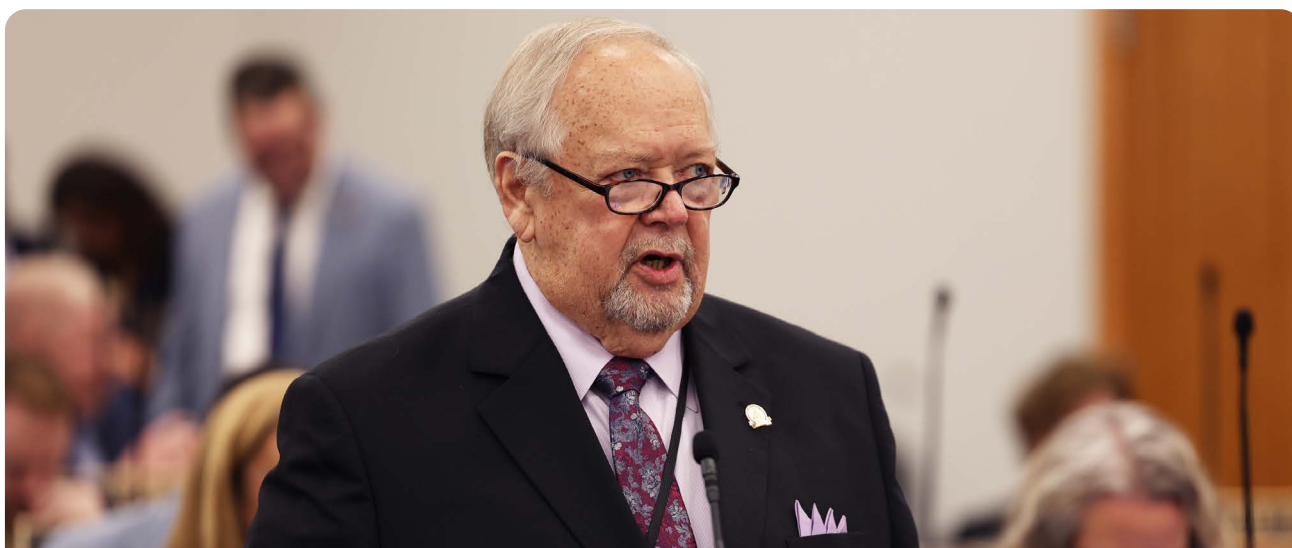
Rep. Jim Gooch | Photo by Legislative Research Commission Public Information

Emergency clause – effective April 14, 2026