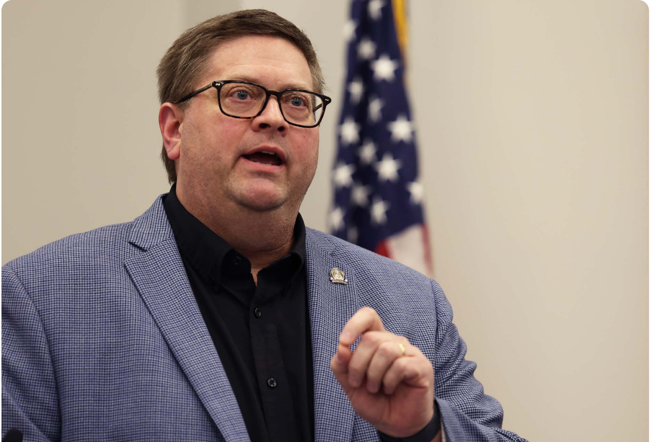
Rep. Jason Petrie | Photo by Legislative Research Commission Public Information