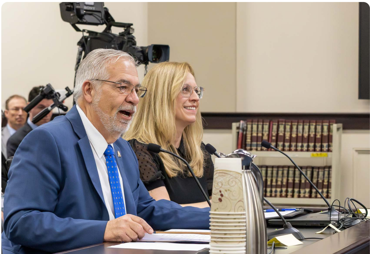
Sen. Greg Elkins and KACo's Shellie Hampton testified in support of SB 149 during the 2026 legislative session.