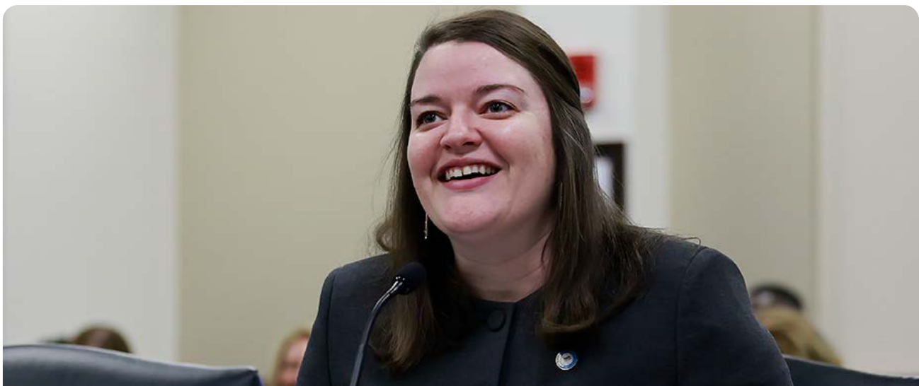
Rep. Samara Heavrin

Emergency clause – effective April 13, 2026