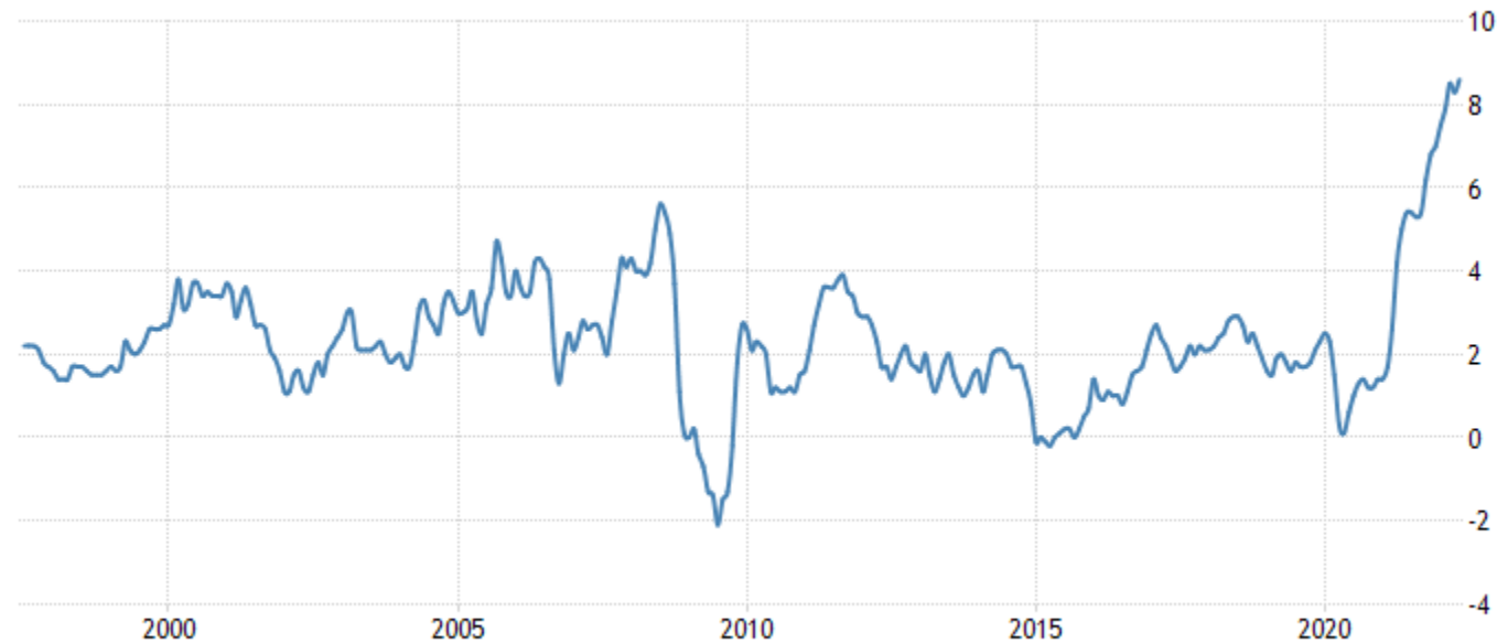
U.S. Inflation Rate, 25 Years

TRADINGECONOMICS.COM | U.S. BUREAU OF LABOR STATISTICS